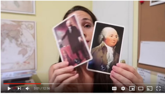
Fun Homeschool Ideas