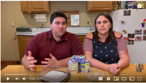
Homeschooling (keep it fun)

Actually Homeschooling allows for freedom from routine. Take advantage of that special aspect to keep us from falling into a rut. It keeps kids wanting to know what surprise you have in store today!